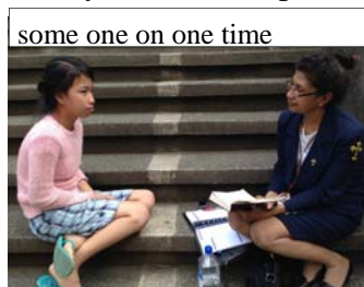
some one on one time