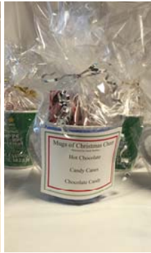
Mugs of Christmas Cheer