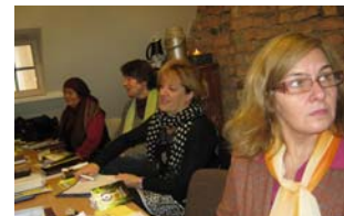
4 American Deaconesses