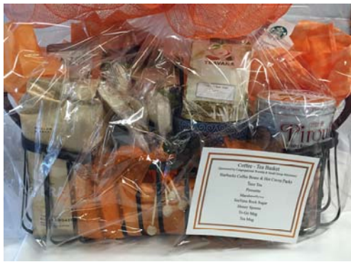
Coffee - Tea Basket