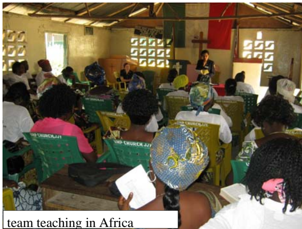
team teaching in Africa

both American and international students, and funding of deaconess internships. It will also permit deaconess students and professors to engage in short term mercy mission trips to disaster-hit areas within our country by rendering spiritual, and emotional care to the women and children. This grant will also provide educational and financial support to our partner churches in other countries who introduced deaconess training programs within their church body. The grant helps promote such theological education to the under privileged women who have a passion to learn confessional theological studies to serve the church.