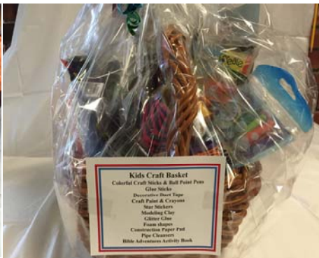
Kids Craft Basket