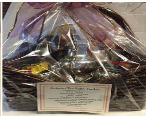
Autumn Tea Party Basket