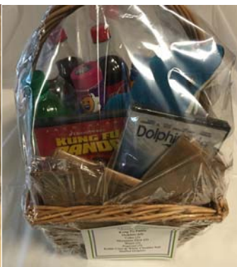
Kids Movie Night