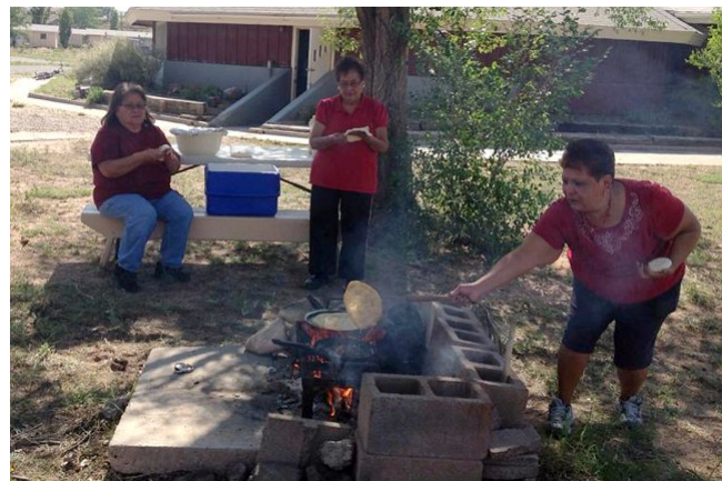
Making Frybread on an open fire