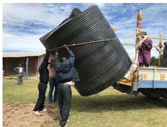
A water tank is being put into place by hand.

This grant will provide clean water and cover travel expenses for pastoral care to students in 12 additional schools and orphanages in Kenya.