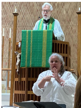
Church Interpreter Training practice in the Concordia Theological Seminary chapel

This grant will help provide interpreters and resources to spread the Gospel message to deaf people in the United States by allowing ELMS to expand its Church Interpreter Training Academy to several satellite locations, potentially training more than 100 new interpreters. It will also enable them to continue ASL translation work of the Lutheran Service Book settings 1, 2, 4, and Matins for the benefit of all those who are deaf.