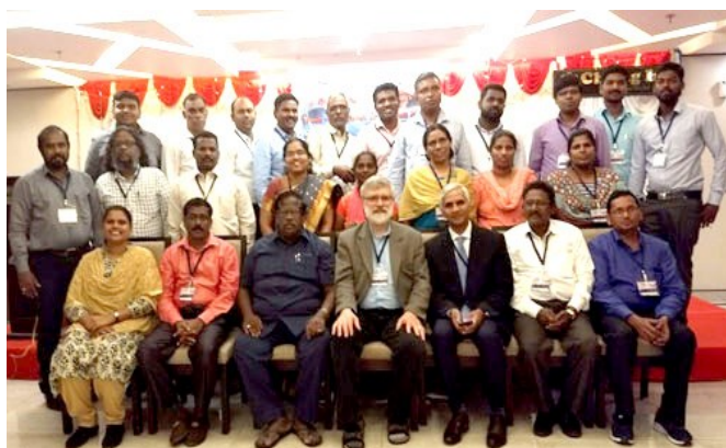
"The Lutheran Study Bible" translation project began at this meeting in South India in 2018. These are the translators who started working on the Tamil language translation.

This grant will provide funds to complete the translation work. With The Lutheran Study Bible translated into their heart language, indigenous Indian pastors, seminarians, and members of Lutheran churches in India and Sri Lanka will better understand and share the Good News of Jesus Christ. The Indian Lutheran Study Bible will significantly bless the India Evangelical Lutheran Church and Ceylon Evangelical Lutheran Church members in Sri Lanka.